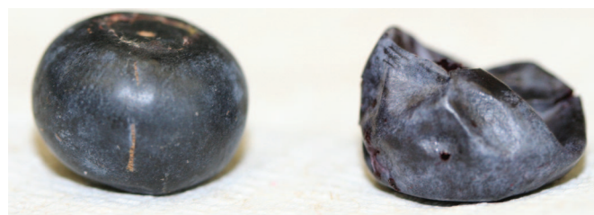
Fig. 5. Infested blueberry (right) exhibits soft, sunken areas two weeks after exposure to D. suzukii when compared with control blueberry (left).

Kanzawa observed that the fly oviposited most often on cherries, peaches, plums, persimmons, strawberries, and grapes in Japan, but