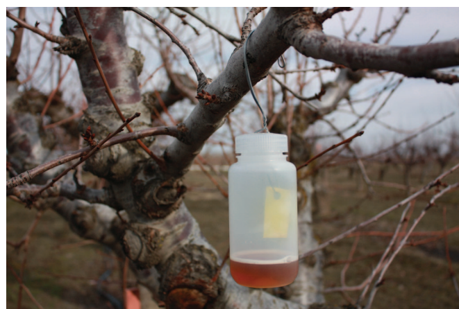
Fig. 7. Drosophila suzukii trap deployed in a cherry orchard.

Biological Control. Parasitoid wasps ( Braconidae and Cynipidae ) are thought to be the primary Hymenopteran families targeting Drosophila spp. and have potential as biocontrol agents against D. suzukii