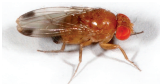
Fig. 2. Adult male; note dark spots on wing tips.

They have black stripes on the abdomen and males have a distinguishing dark spot on the leading edge near the tip of each wing. The spot may play a role in courtship but results are ambiguous for flies under diurnal light cycles (Fuyuma 1979). The female's serrated ovipositor (Fig. 3) is able to penetrate the skin of most thin-skinned fruit, leaving a small depression, scar, or "sting" on the fruit's surface (Fig. 4). A female lays \approx 1 –3 eggs per oviposition site, averaging 380 eggs in her lifetime. The number of eggs laid may depend on fruit maturity and eggs tend to be randomly distributed on cherry fruit (Mitsui et al. 2006). Multiple clutches of larvae are quite possible on