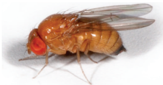
Fig. 1. Adult female Drosophila suzukii .