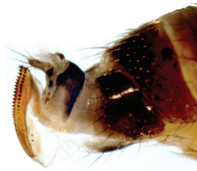
Fig. 3. Serrated ovipositor of D. suzukii .

They have black stripes on the abdomen and males have a distinguishing dark spot on the leading edge near the tip of each wing. The spot may play a role in courtship but results are ambiguous for flies under diurnal light cycles (Fuyuma 1979). The female's serrated ovipositor (Fig. 3) is able to penetrate the skin of most thin-skinned fruit, leaving a small depression, scar, or "sting" on the fruit's surface (Fig. 4). A female lays \approx 1 –3 eggs per oviposition site, averaging 380 eggs in her lifetime. The number of eggs laid may depend on fruit maturity and eggs tend to be randomly distributed on cherry fruit (Mitsui et al. 2006). Multiple clutches of larvae are quite possible on